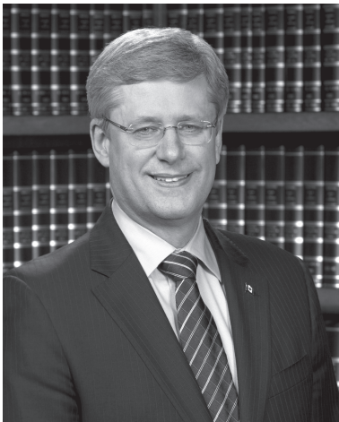
The Rt. Hon. Stephen Harper, P.C., M.P.

A stylized, handwritten signature in black ink, reading "Stephen Harper".